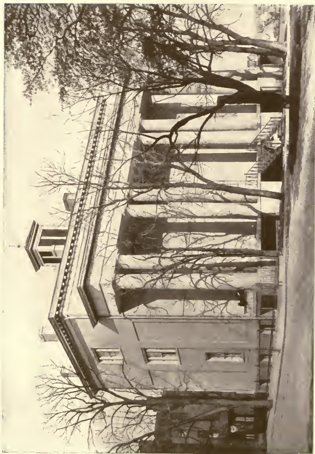
THE DAVIS MANSION IN RICHMOND, THE "WHITE HOUSE" OF THE CONFEDERACY.